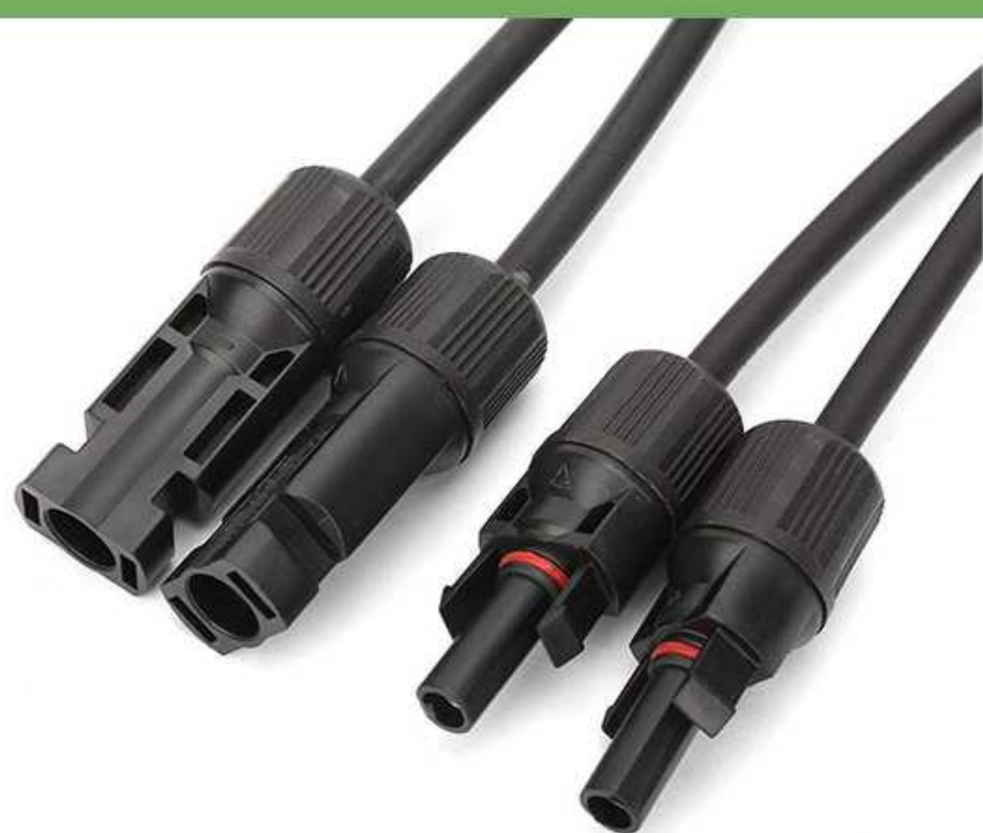
Cable with Connector