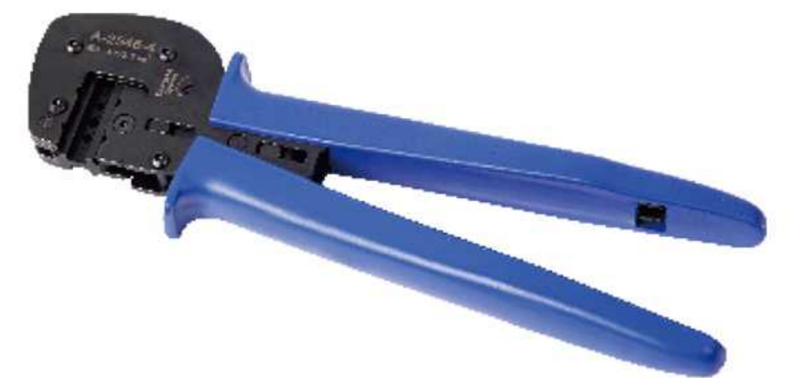
MC4 /MC3 Crimping Tool